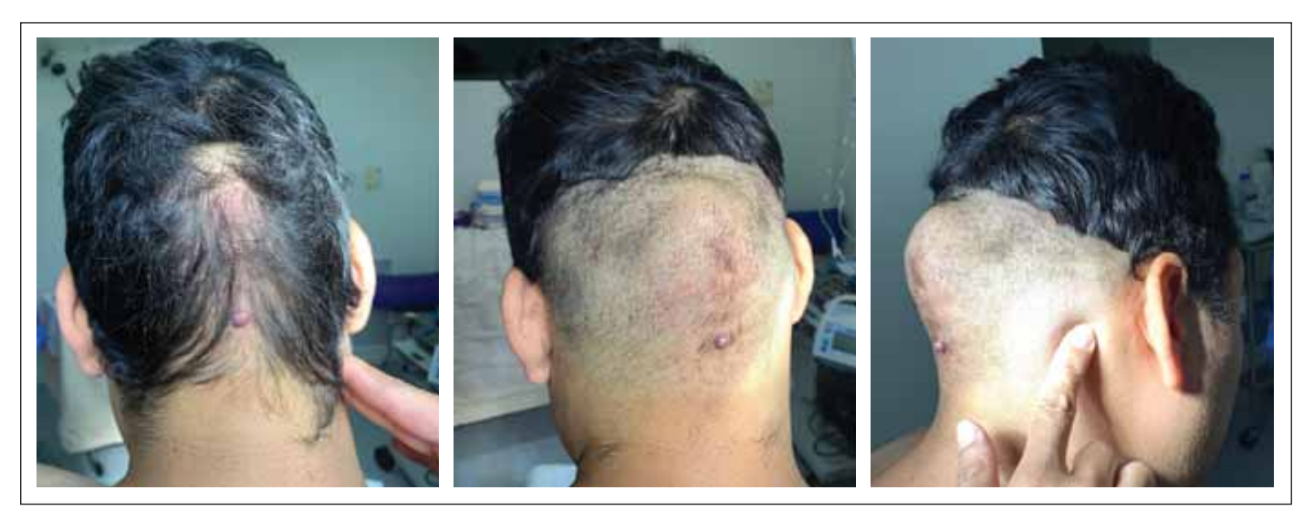
Fig. 1. Photographs prior to surgery. Obr. 1. Fotografie před operací.

Accepted for review: 8. 5. 2021 Accepted for print: 21. 6. 2021