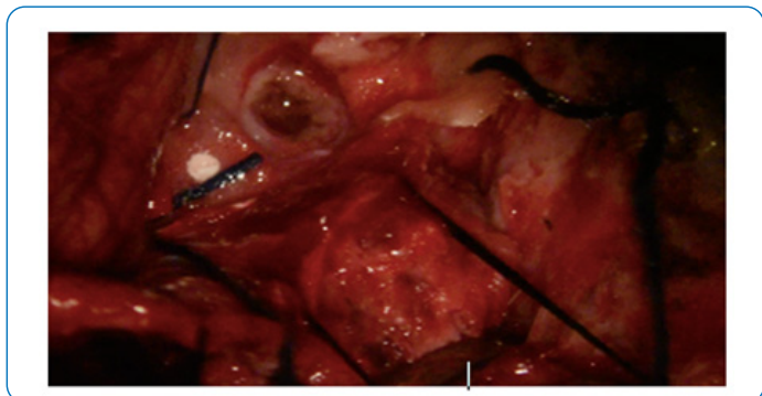
Image 3: Trans-surgical image showing in situ tumor location in foramen magnum, homogeneous in appearance, solid consistency and compression of adjacent structures.

a solid tumor lesion is located with mass effect on the brainstem, debulking is performed, luxation of the lesion is performed, with adequate visualization of cranial nerves XI and XII at the end of the basilar artery with 90% tumor extraction (Image 3).